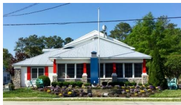
Settled in at 111 Atlantic Ave., Ocean View, and celebrating 18 years this weekend!