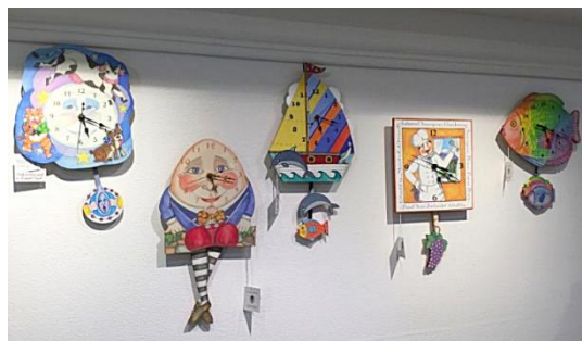
These wonderful hand painted wooden clocks by Richard Floyd can be found in our side room showcasing many American handmade gifts, home decor, children's books and jewelry.

Now I need your help. Shopping will help tremendously, but more than that, please pass along word about our new location and bring your visiting friends in when you're looking for things to do. There's no relocation signage up at our previous downtown location and people are having problems finding us. So please tell your friends! (Explicit location directions and a scanable Google map QR code link can be found below.)