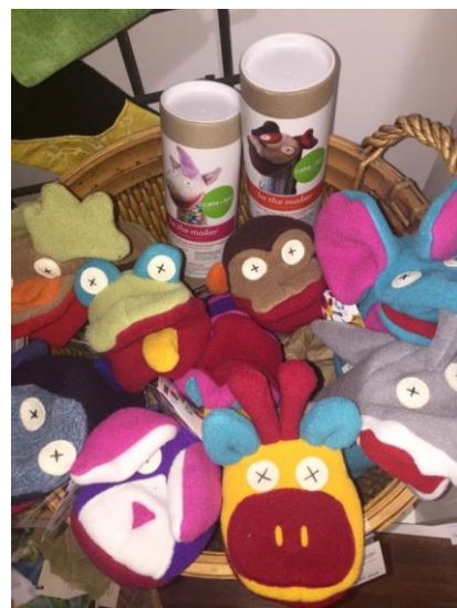
Hand made puppets ~ and puppet kits ~ are a fun and creative activity for visiting children and grandchildren on rainy days. I'm so glad to have the space to do creative things for youngsters! See what else is new!

I hope on this busy weekend you'll come take a break from the hustle and bustle, enjoy the peace and natural beauty of our new setting, discover my newest paintings (website is updated) and my artisans' newest works and spend a few moments sitting on the sofa or chair in my favorite room and chatting with me.